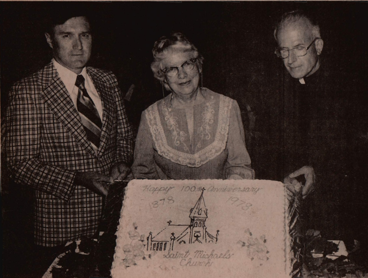
'JUBILEE' CAKE MARKS CENTENNIAL