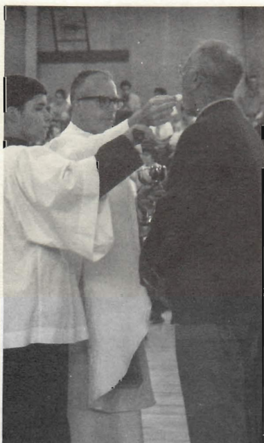
Monsignor's Silver Jubilee Mass was held in the Livermore High School gymnasium to accommodate everyone. Thirty-eight of his family, including three of his four brothers, a great-aunt, aunt, and numerous nieces and nephews joined the parish in celebrating. The Altar Society made the Mass vestments, which are still used today.